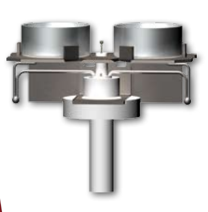
Plate-shaped DSC rod

The DSC131 evo transducer has been designed using plate-shaped DSC rod technology and is constructed from chromel-constantan.